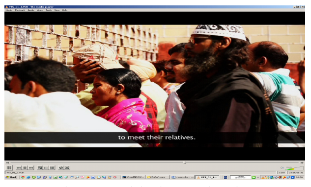
Prisoners at visitation area in prison

Under the old method of face-to-face visitation, inmates were transferred from their housing area to the visitation area inside the prison, while visitors often had to walk to outer space earmarked for visitors to talk to inmates standing at netted/secured windows (visitation area) inside the prison premises for this purpose. Interaction between inmates and their relatives through netted windows lacked privacy besides being inconvenient.