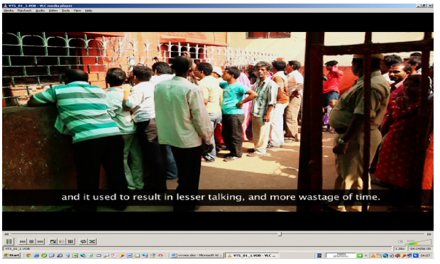
Visitors at visitation area in Prison

Video Visitation is the use videoconferencing systems and software to allow inmates of a prison and visitors (family members, friends, relatives etc.) to interact without physically meeting or travelling to prison campus. It allows inmates to meet their family members and friends from anywhere in Jharkhand at lower cost, at higher frequency for longer duration with more privacy. Higher bandwidth of connectivity provides clarity of voice and video. The system substitutes traditional system of physical meeting reducing the earlier requirement of prison staff thereby increasing their productivity in prison management. As there is no physical meeting there is no risk of transfer of prohibited items improving the security of prisons. It has improved the productivity of prison and its staff as well as security of prisons. Further, it provided inmates and their families a psychological security as they could interact with ease, convenience, clarity,