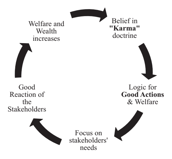
Fig. 2 Karmic Cycle in Institutions

Further, the outcome of a Karmic approach to leadership leads to the right actions which again lead to organizations recalibrating themselves on the right action-reaction cycle which only leads to increased chances of concurrently achieving the objectives of wealth and welfare maximization through optimal utilization and nurturing of both the human ( people ) and the non-human capital ( natural resources, infrastructure, production systems, etc ). The karmic cycle in institutions can be illustrated with the help of the diagram below. As we can see in Figure 2, the belief in karma leads to right actions ; right actions lead to right reactions by stakeholders; and finally right reactions lead to further strengthening the belief of the institution and leader on the karma doctrine which then starts the cycle again.