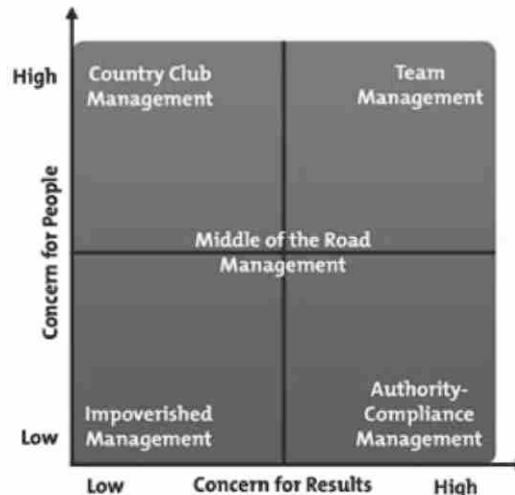
Fig 1: Managerial Grid