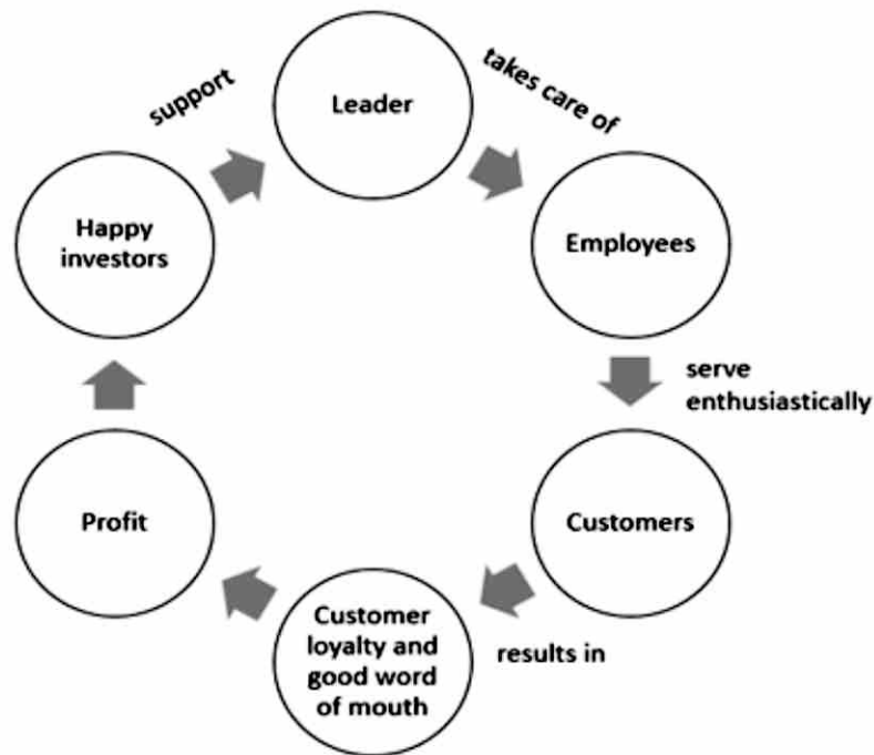
Figure 2: How happiness spreads across all stakeholders in an organization

Figure 2 above depicts the process by which a Humanistic leadership style is able to ensure a highly motivated workforce which in turn takes care of the customer needs making them satisfied. Customer's satisfaction leads to higher profitability thus making investors happy about their investment in the company. The investors trust and support to the leadership helps